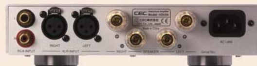
▲ Unbalanced RCA and balanced XLR input terminals on the rear panel. The RCA terminals are gold-plated for high grade sound. Large gold-plated speaker terminals with plastic protector covers, compatible with extra-thick speaker cables.