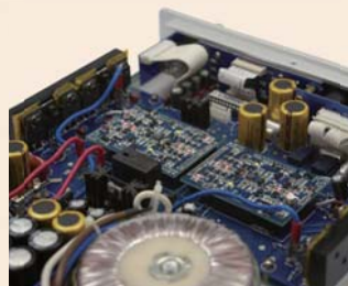
▲ A large 50W toroidal transformer in a compact body. Balanced left/right independent circuitries.